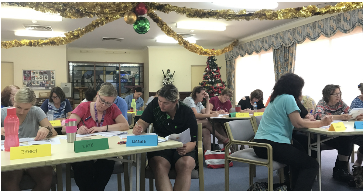
Staff undertaking an emergency response assessment during the last mandatory training session for 2018.

We have a lot to work towards with a busy year ahead, but I look forward to seeing you again in 2019!