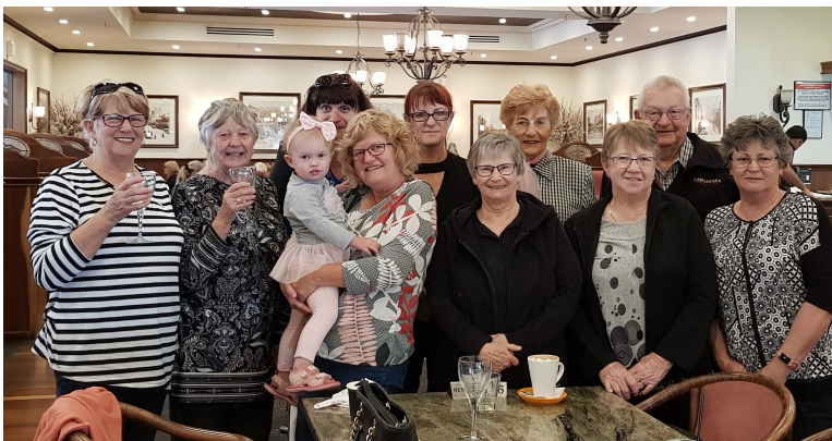
Left: The volunteers during their day trip to Virginia Nursery.

If you would like to join our volunteer team at Barunga Village, please give us a call on 86 350 500.