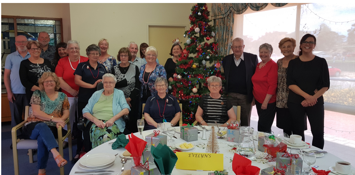
Below: A happy snap taken of the volunteer group during their annual Christmas luncheon.